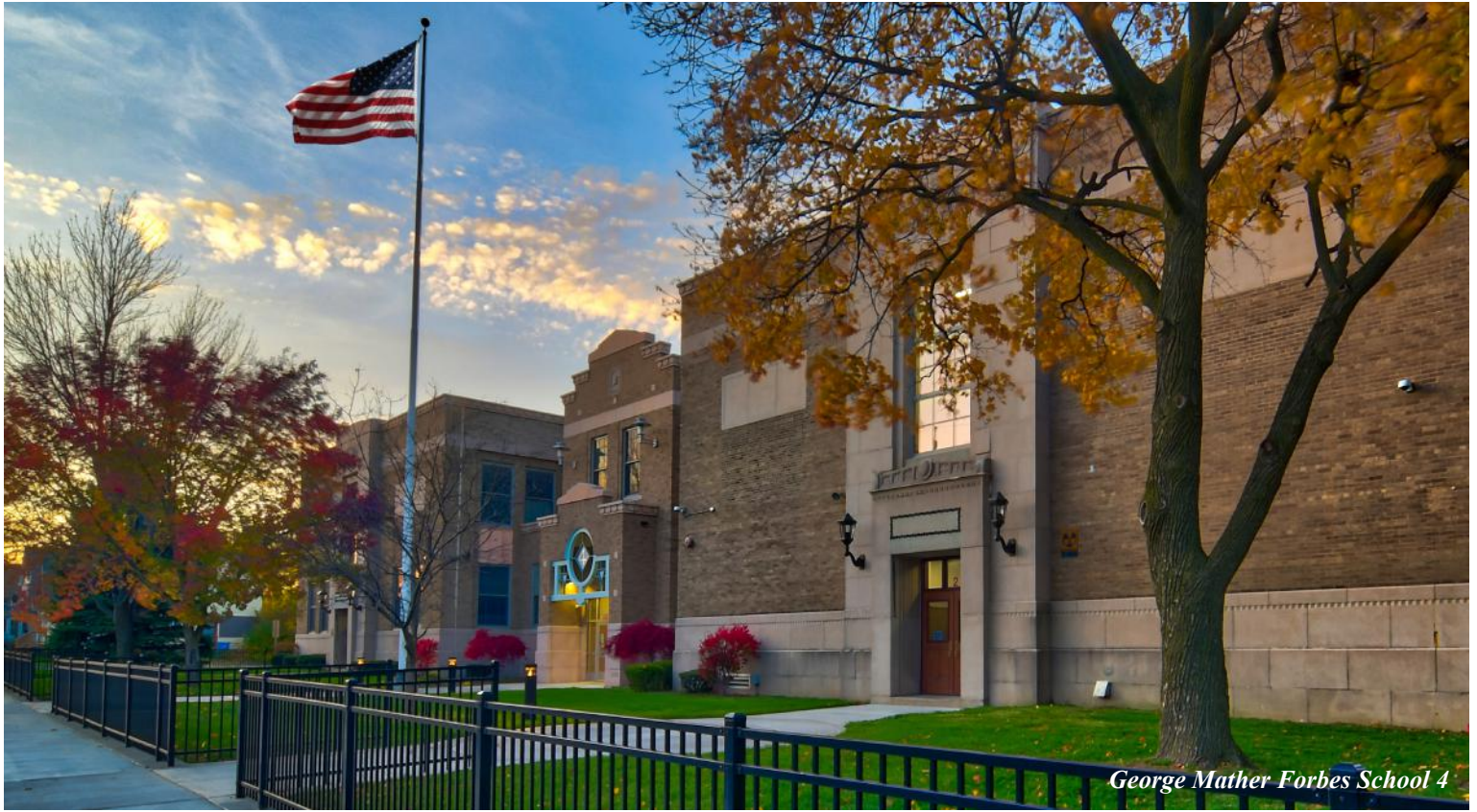
George Mather Forbes School 4

A Periodical Insight into the Award-Winning Rochester Schools Modernization Program