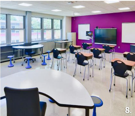
Key: 1. Bus Loop 2. Cafeteria Kitchen 3. Cafeteria 4. Makerspace 5. New Addition 6. Courtyard at twilight 7. Library 8. Classroom