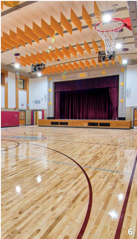
Key: 1. School Building 2. Classroom 3. Makerspace 4. Cafeteria 5. Library 6. Gymnasium